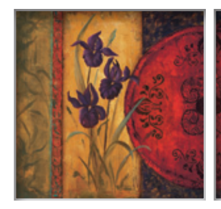
WSR 34M-35M Title: Iris Fusion I-II - mini Size(s): 12x12, 24x24