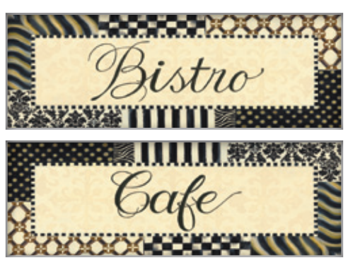
SMI 48-49 Title: Bistro, Cafe Size(s): 18x6