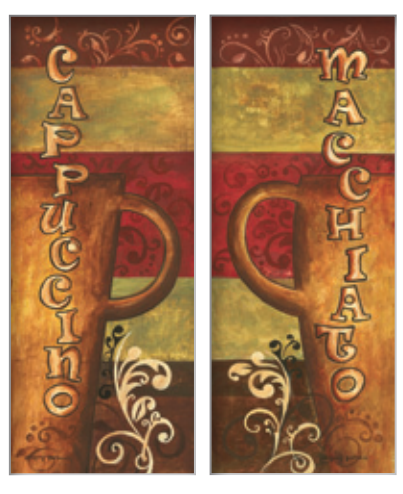
GOR 182-183 Title: Cappuccino, Macchiato Size(s): 8x20

Warm colors and themes abound in the Gango Editions line of images. Whether your space is in a warm climate or you are trying to warm up a cold space, you will find an abundance of choices at Gango Editions.