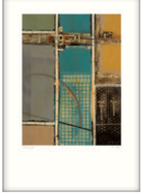
JCLTZ 107-108 Title: Circuitry I-II Size(s): 25x36