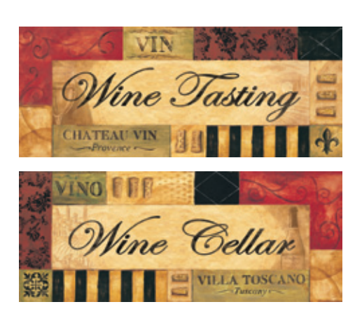
GOR 170-171 Title: Wine Tasting, Wine Cellar Size(s): 20x8