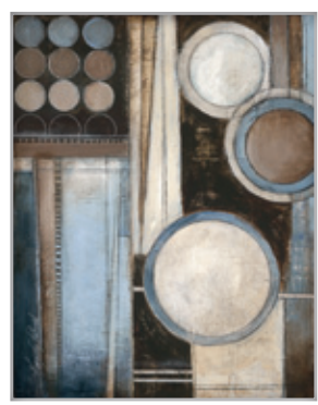
POL 206-207 Title: Blue Notes I-II Size(s): 22x28